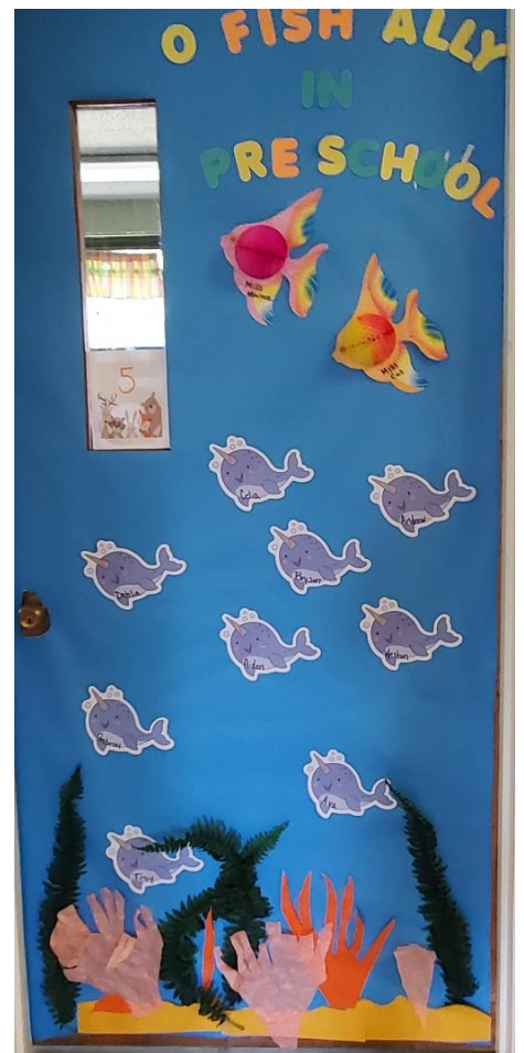
Classroom doors welcome students (L to R: 2's, 3's, and 4's)